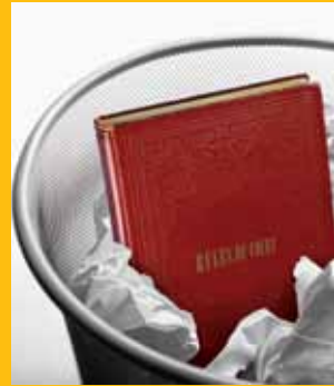
Cover Rules of Court